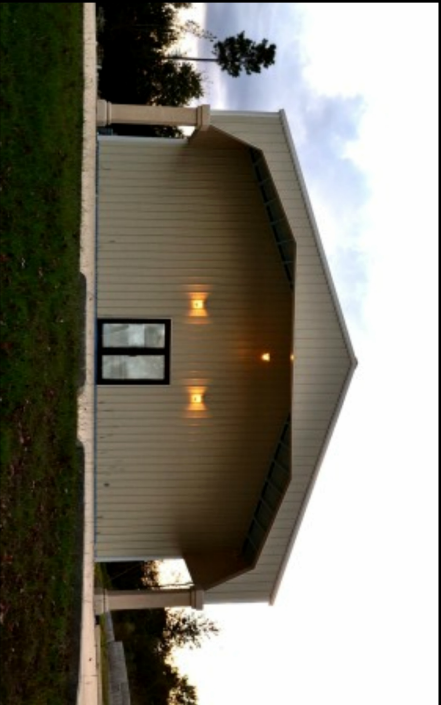
Covenant Life Tabernacle