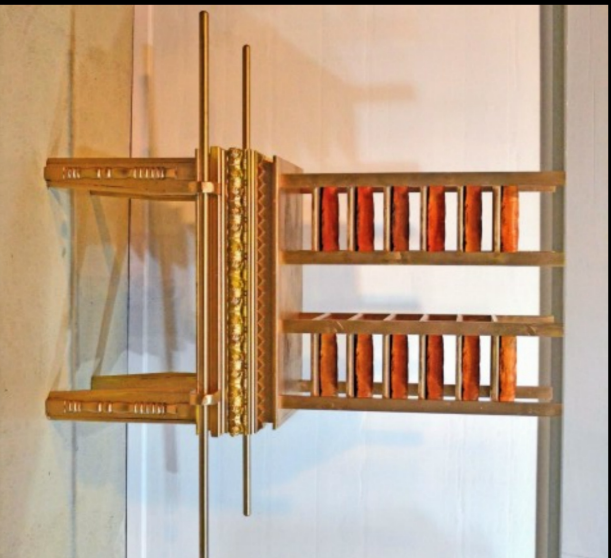
The Table of Shoubread