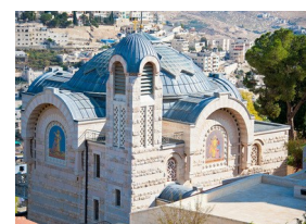
House of Caiaphas